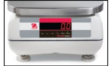
Valor 2000 with rear LED display